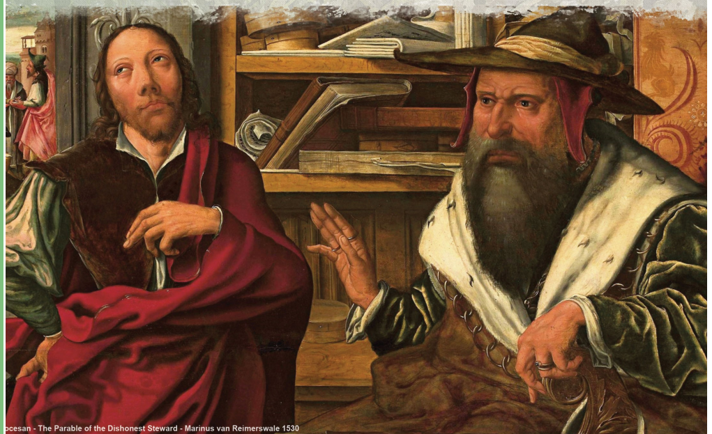
Diocesan - The Parable of the Dishonest Steward - Marinus van Reimerswale 1530